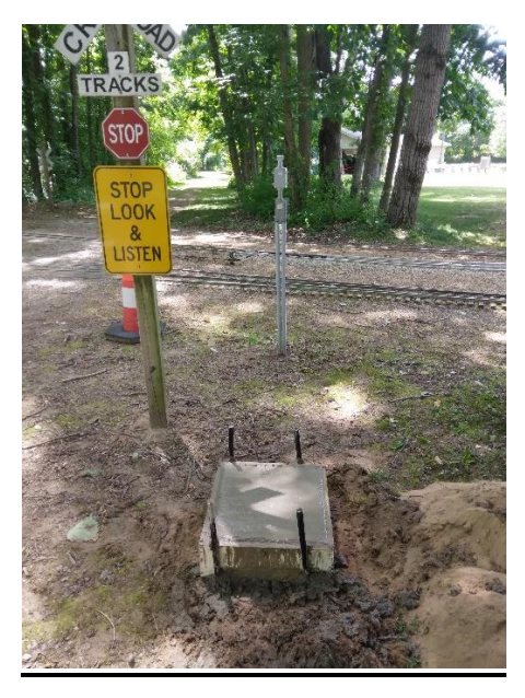
At the south road crossing work is underway to add a set of grade crossing signals. The lights and signs were dropped of Sunday. The pole and bell will follow.

Last month Tim Childs wrote about the grade crossing signals south of the depot. With Tim's work designing the track circuitry we can look at expanding crossing protection and signals on the railroad. You may have seen the concrete blocks popping up along the track.