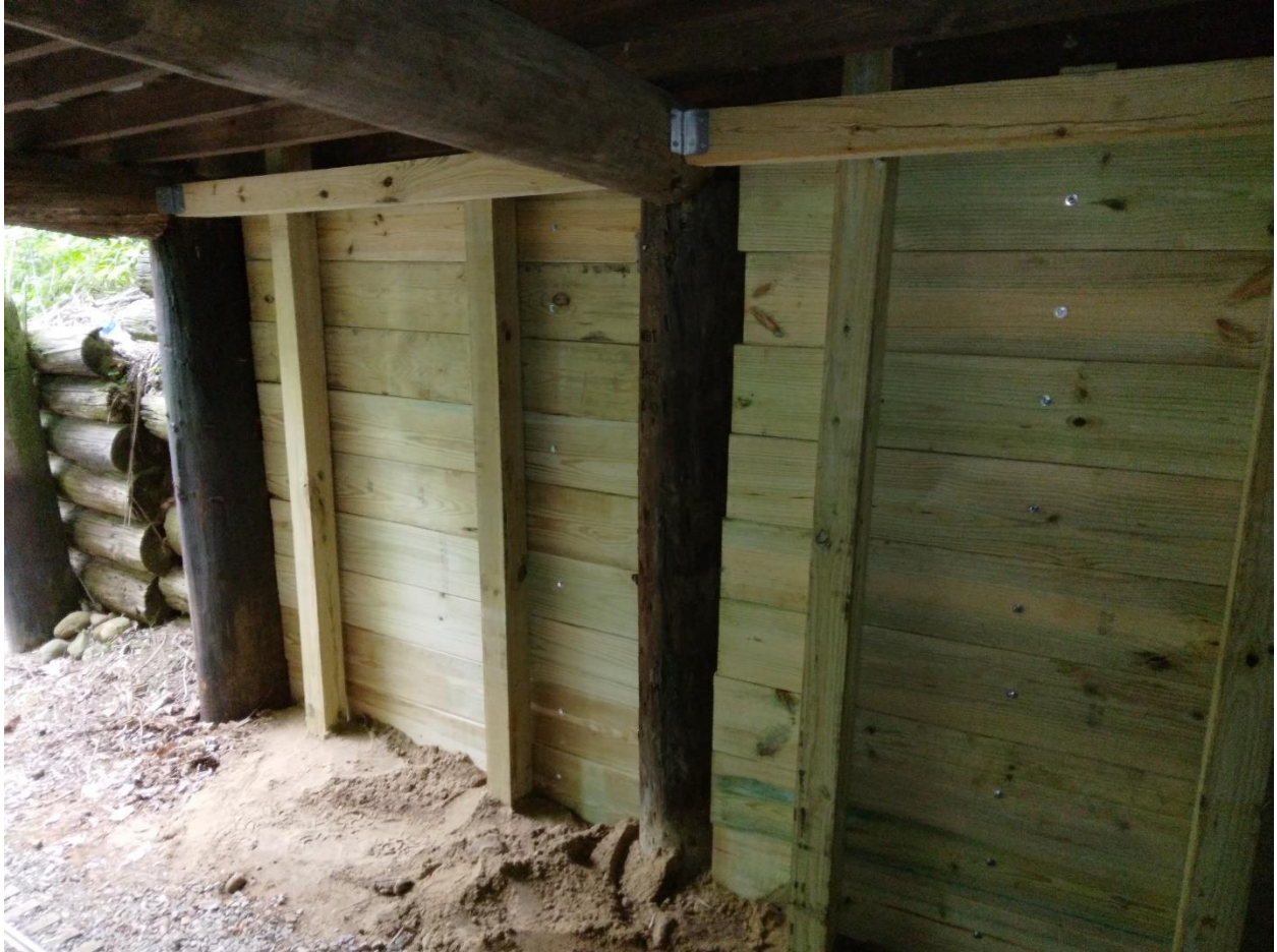
Two new tunnel wall sections.